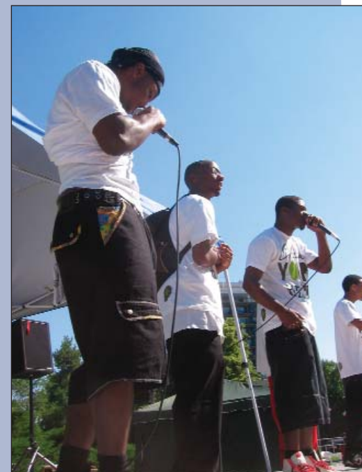
Teens from the Check Your Head program perform at the Black Arts Festival.