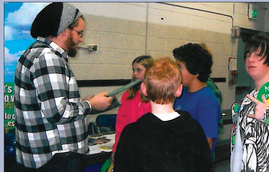
Students at Red Rocks Elementary talk about feelings and emotions and learn healthy ways to express themselves.

The Pro Bono Outreach Program provided professional mental health therapy services to 1,295 low-income children, teens, families, and adults — at no cost to service recipients — at 31 host sites throughout the Metro Denver area. Volunteer mental health professionals donated 7,747 client hours of services to the program, valued at $774,700.