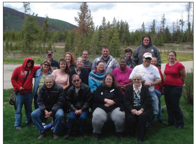
Leadership Academy class of 2009.

The Wellness and Education Coalition & Advocacy Network of Colorado (WE CAN!) is a statewide grassroots organization run by and for individuals with mental health conditions. WE CAN! provides support to its members and advocates for progressive state and local policies pertaining to mental health. In 2009, 26 individuals received advocacy training through WE CAN!'s Leadership Academy. Throughout Colorado, 590 WE CAN! members participated in discussions about the quality of their behavioral health services. This information is reported to the Colorado Division of Behavioral Health for planning purposes.