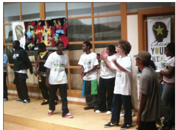
East High School students' Check Your Head assembly.

Through The Pro Bono Outreach Program professional volunteers provided free mental health services to 1,270 homeless and low-income children, teens, families, and adults throughout the Denver metro area in 2009. These volunteers donated 7,450 client hours of service to the program, valued at $745,000.